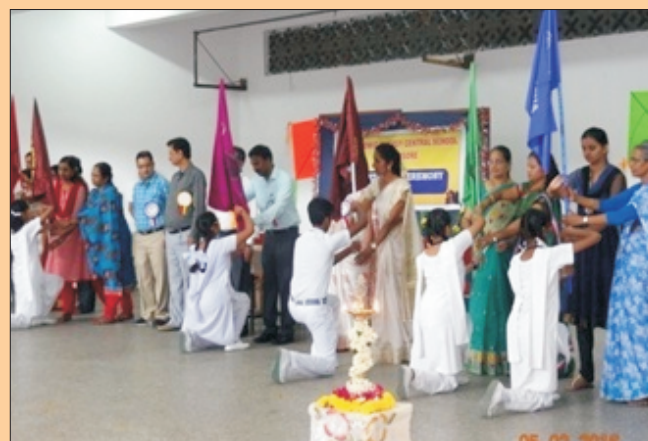
Flags are handed over to the office bearers

Combined and Conscientious Effort for Continuous Comprehensive Education